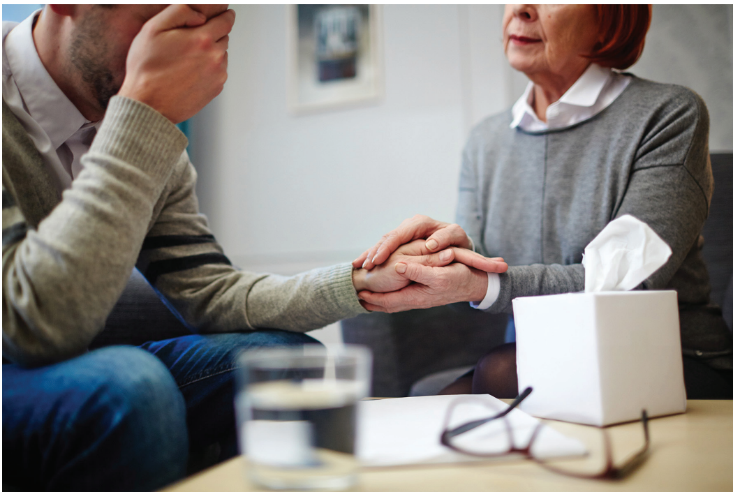
Chaplains provide emotional support to patients, families, and colleagues.

In addition, chaplains provide emotional support, ease anxieties during times of uncertainty, and help patients and family members find strength during stressful times. 3 Chaplains also help patients and family members navigate through difficult medical choices, grounding their decision-making process in their values, beliefs, and preferences. 3 (See the sidebar on page 9 for more about what chaplains do for patients and family members.)